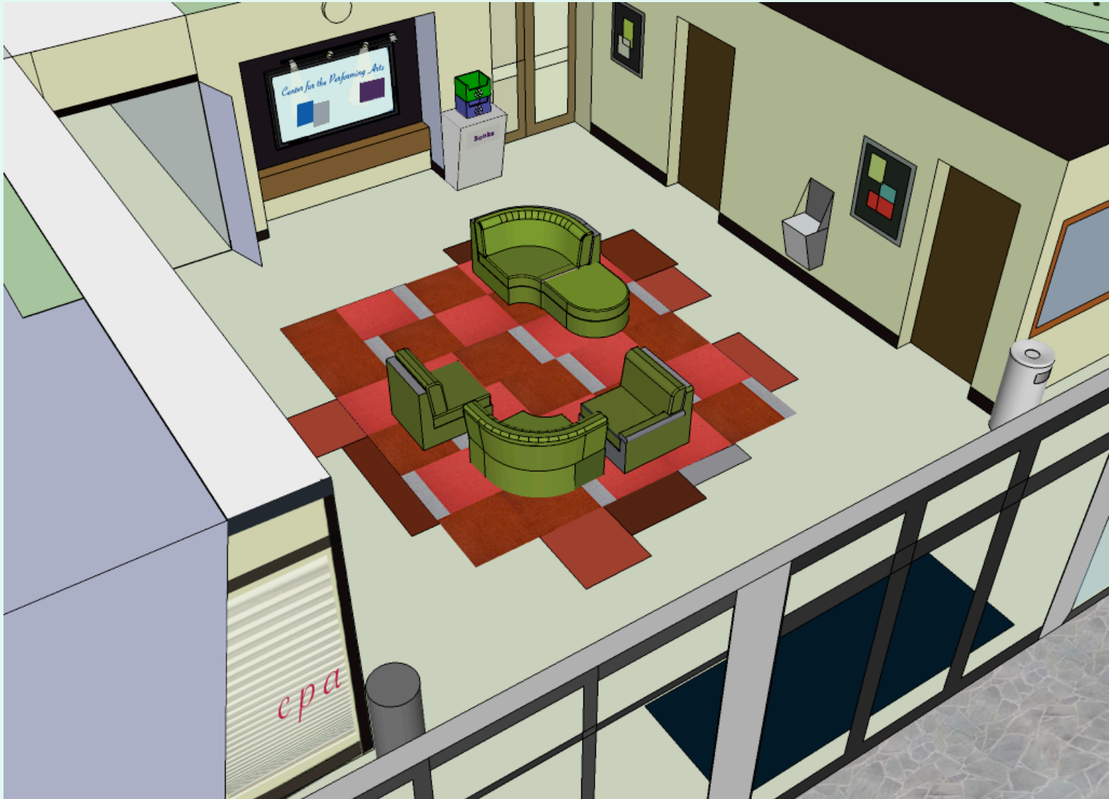
Alternate furniture design Scheme

LCD screen displays Images and Videos. Interactive with viewer's touch.